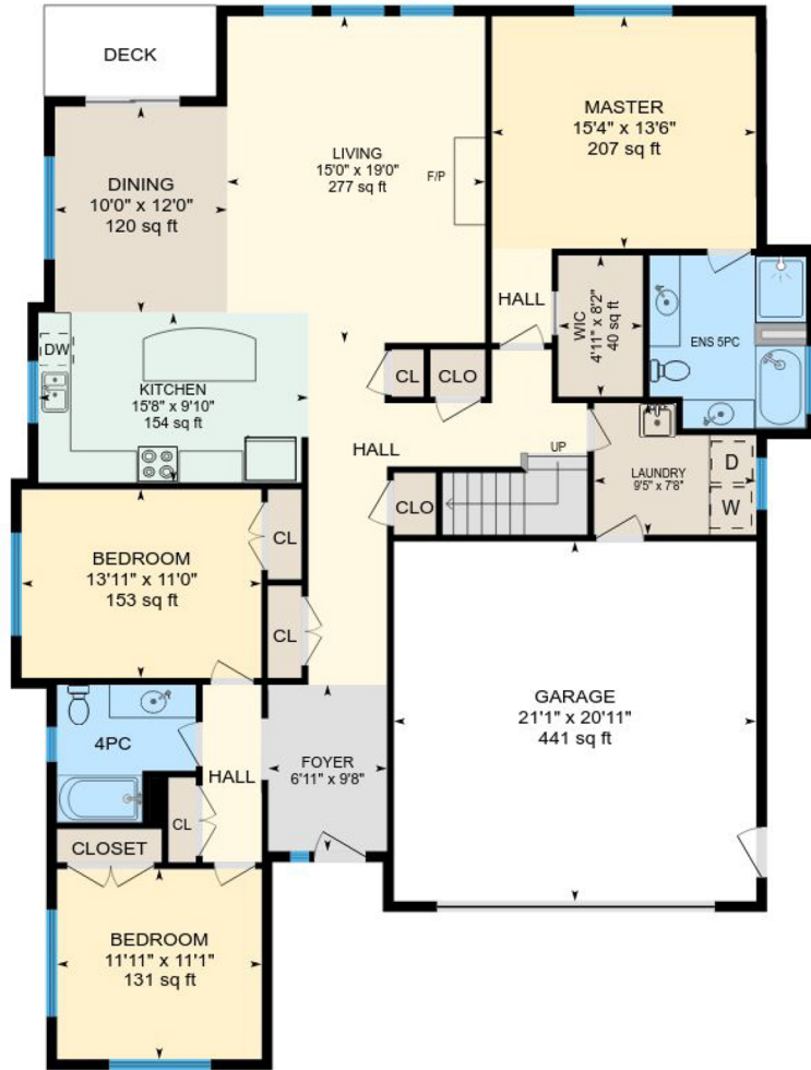
Main Floor Exterior Area 1869 sq ft

Total Exterior Area Above Grade 2344 sq ft (Main Building)