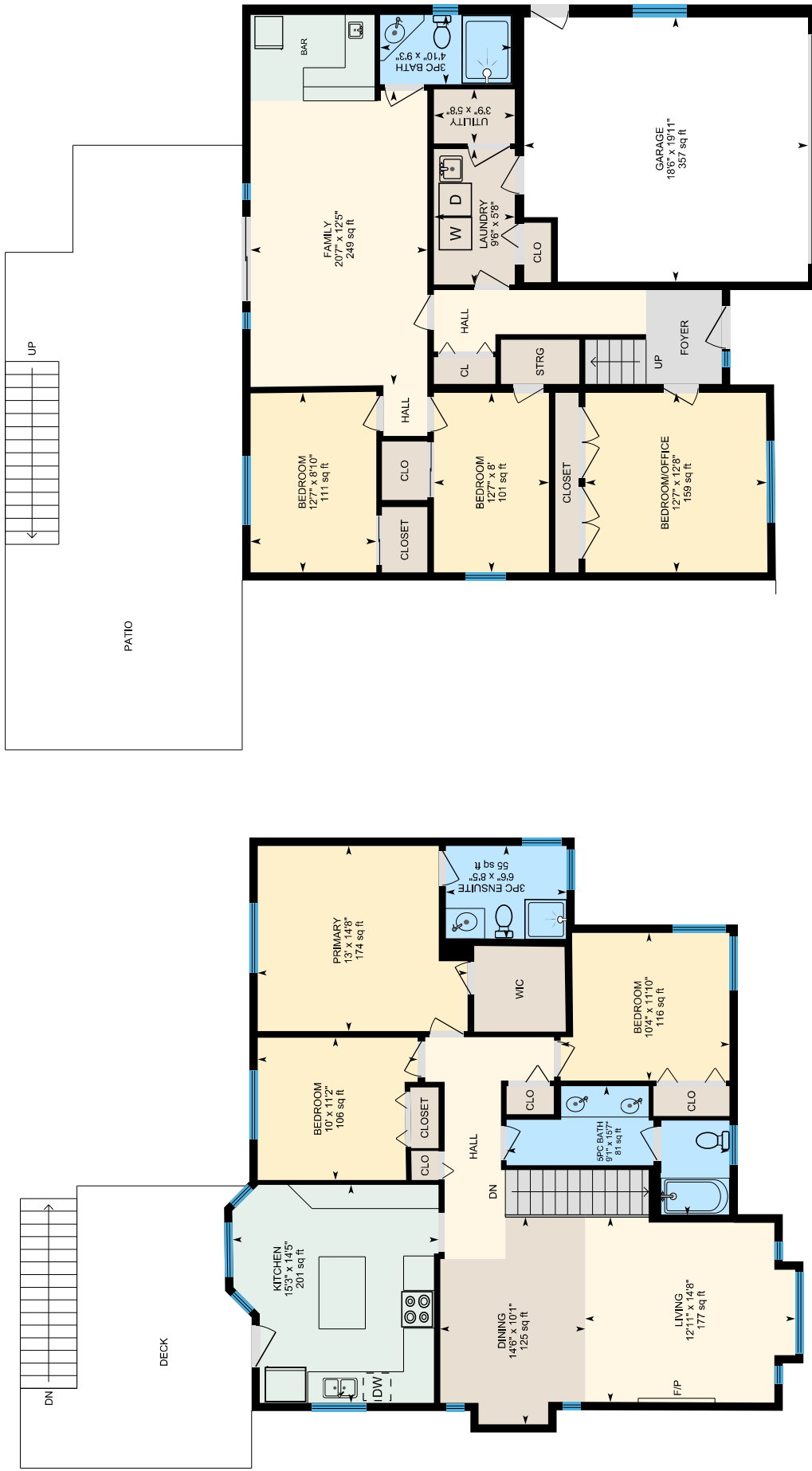
LOWER FLOOR Exterior Area 1148.39 sq ft

Main Building: Total Exterior Area 2527.28 sq ft